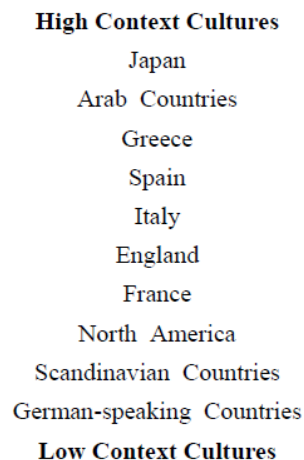
Figure 1. Understanding cultural differences . Hall, E. and M. Hall (1990)

From the definitions, it is apparent that high-context culture and low-context culture are opposite. In order to distinguish these two cultures, Hall (1990) proposed a set of parameters to help situate cultures along a cultural arrangement from high-context to low-context dimensions (Figure).